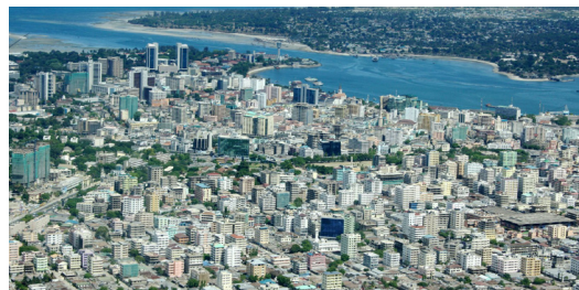
Dar Es Salaam, Tanzania

Artificial Intelligence (AI) could also further enhance a sponge city's effectiveness. By collecting and analyzing a wide range of data, such as land conditions and river flow, smart cities with AI models are capable of predicting when floods will happen. Deep learning models could differentiate between different types of floods that all require unique response strategies. With constant adaptation, these models learn from each flood, each human response, thus becoming more skilled at anticipating future events.