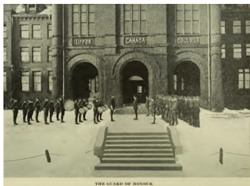
College Times, 1920 (Easter)