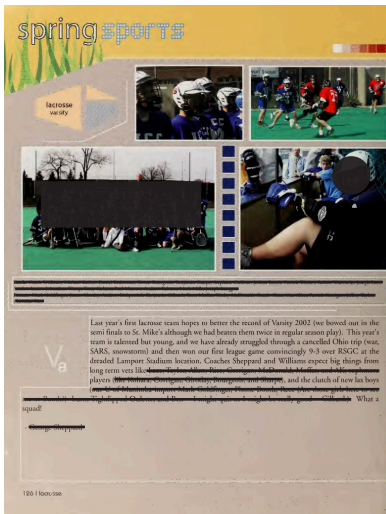
The UCC lacrosse team page from the 2003 issue of College Times: "We have already struggled through a cancelled Ohio trip (war, SARS, snowstorm)..."

Although Canada did not participate in the invasion of Iraq, the ripple effects of the conflict were felt here at the college.